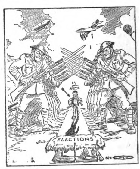
Note.—Arrow indicates a free and untrammelled citizen of Nicaragua on his way to the Polls! (Labor, Washington).