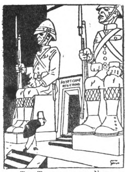
THE TEMPLE ON THE NILE. Egyptian independence remains, as hitherto, free from any enroachment by Britain.